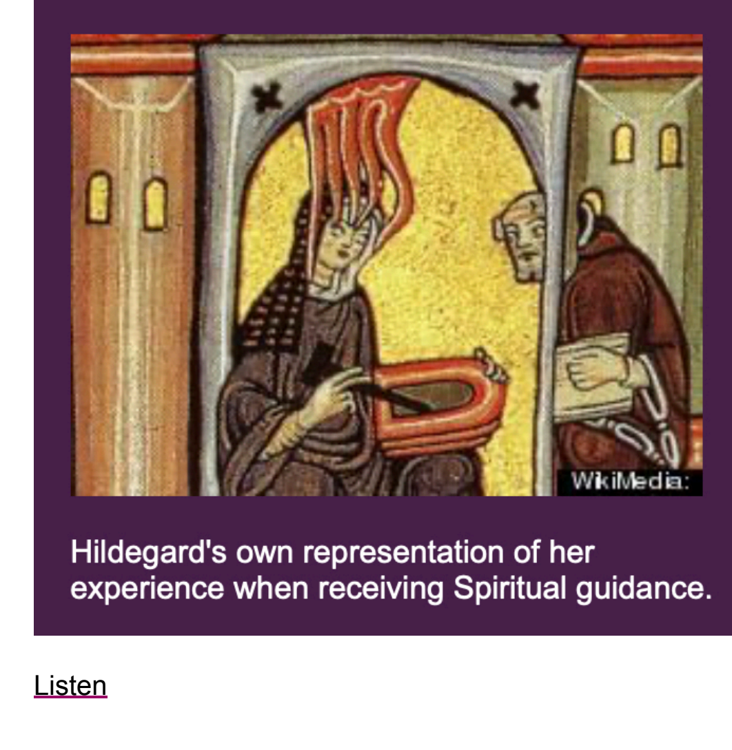
Hildegard's own representation of her experience when receiving Spiritual guidance.